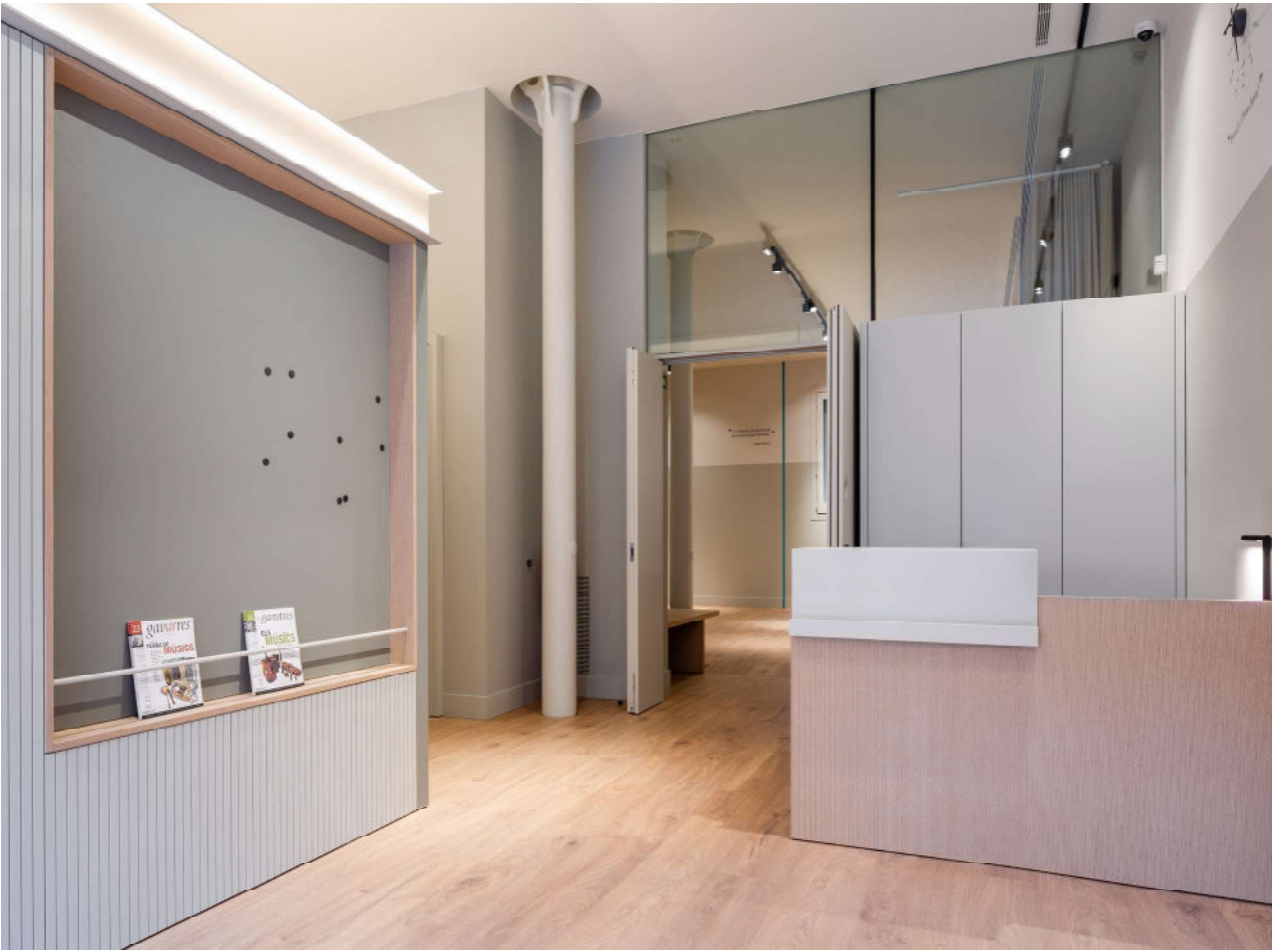
PROJECT: ESTUDI MAITE PRATS ARQUITECTURA INTERIOR