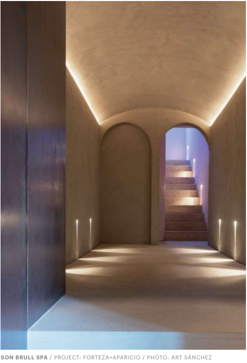
SON BRULL SPA / PROJECT: FORTEZA+APARICIO