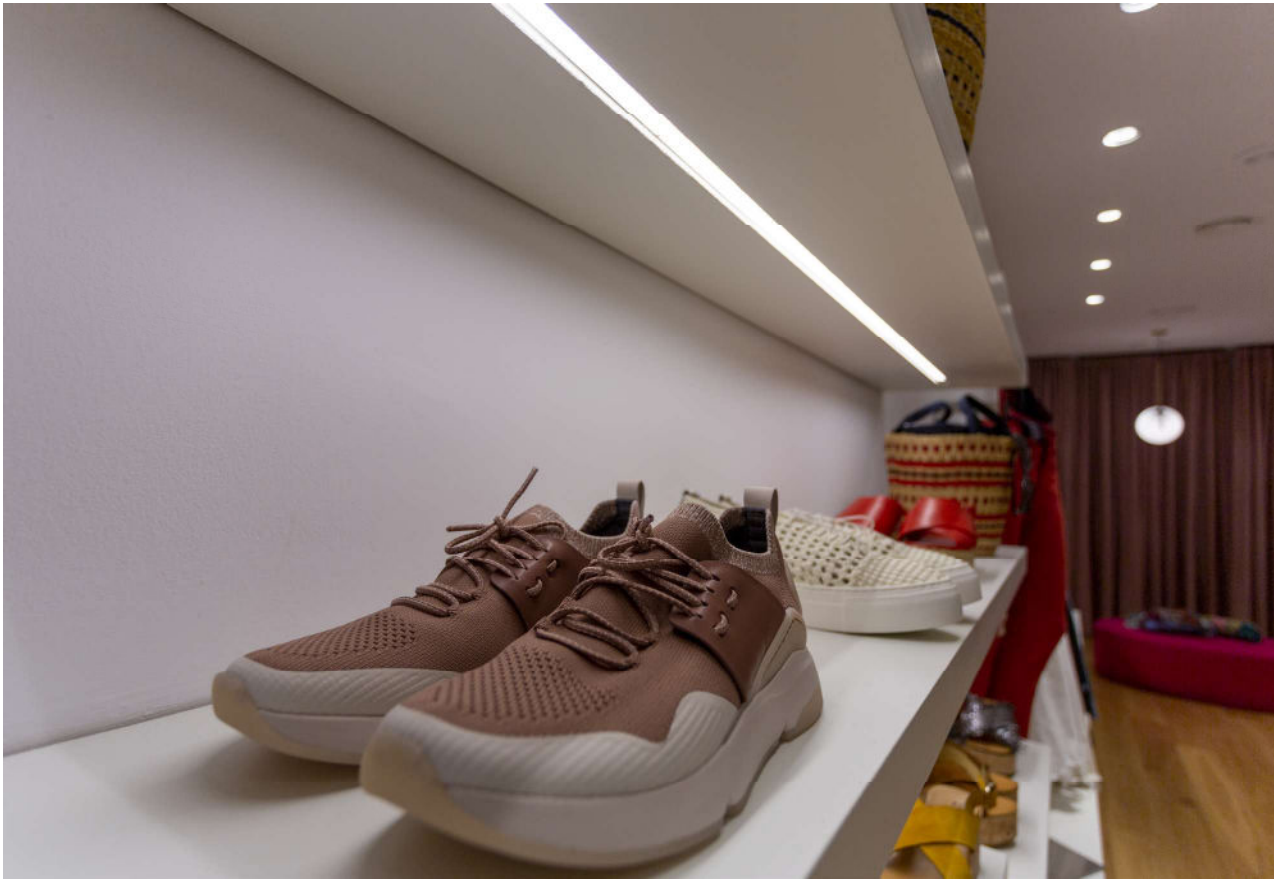
SIZE / PROJECT: MARTA BACQUELAINE