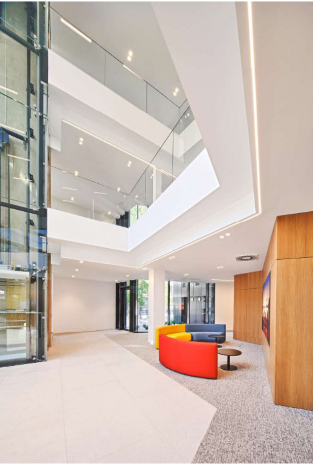
MAGIC BOX / PROJECT: ELASTIKO ARCHITECTS