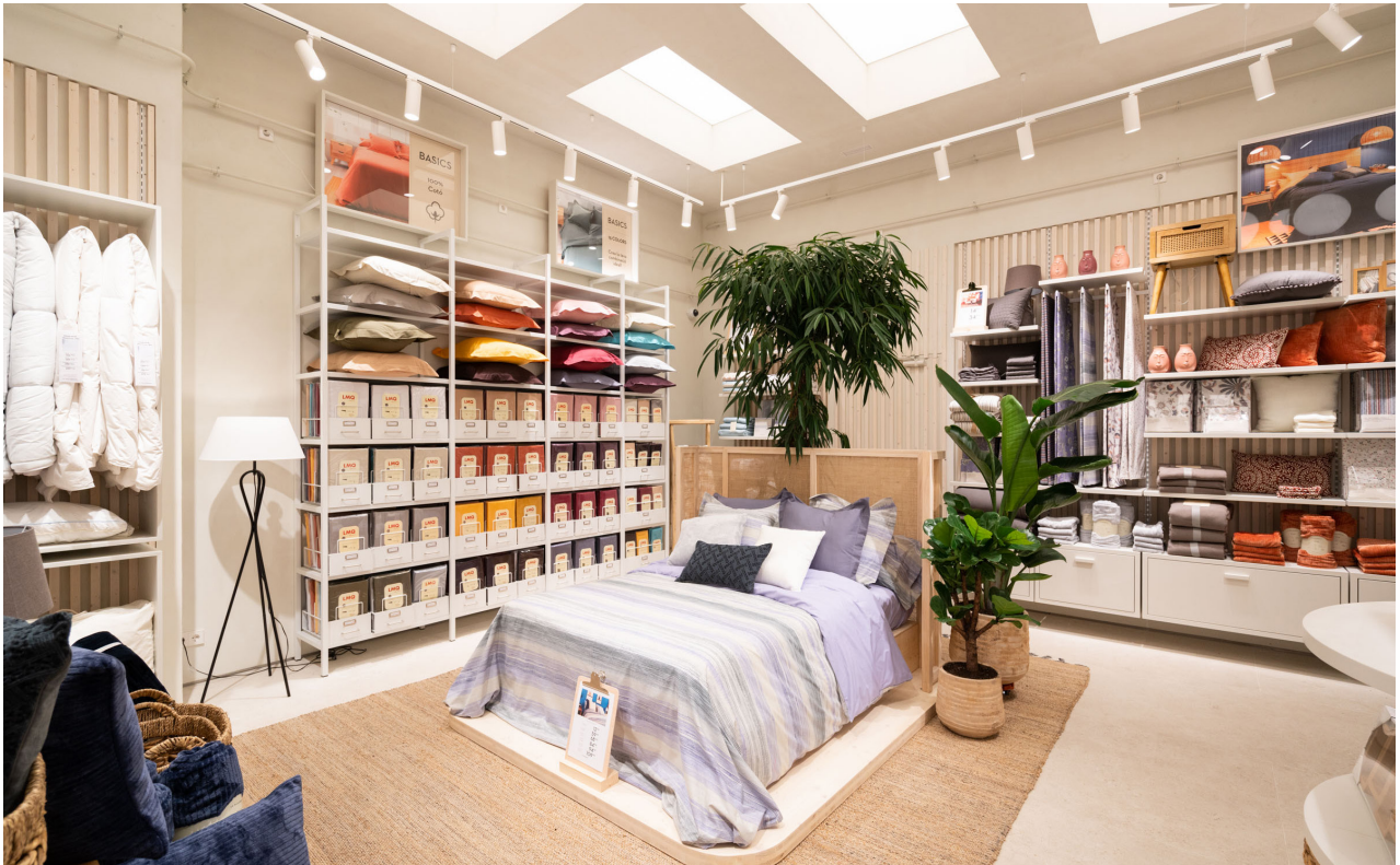
PROJECT: LA MALLORQUINA / ESTUDI FRANCESC PONS