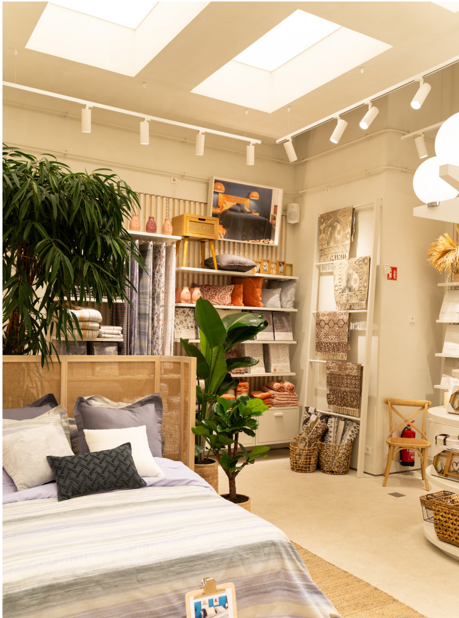
PROJECT: LA MALLORQUINA / ESTUDI FRANCESC PONS