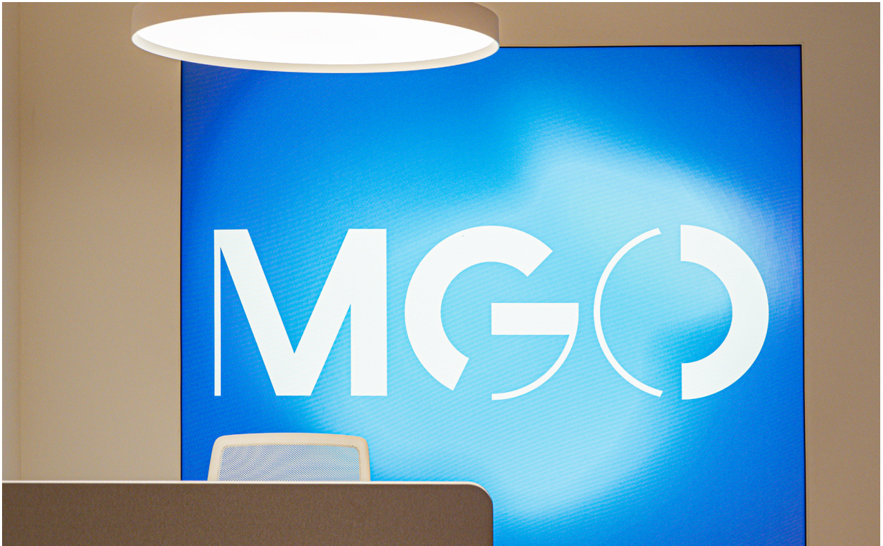
PROJECT: MGO IMMOBILIÀRIA / SANDRA SOLER STUDIO