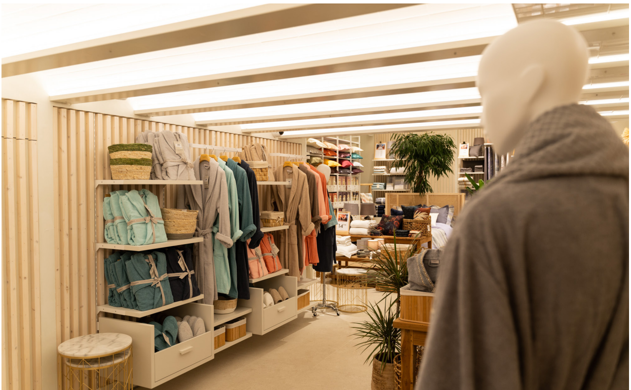
PROJECT: LA MALLORQUINA / ESTUDI FRANCESC PONS