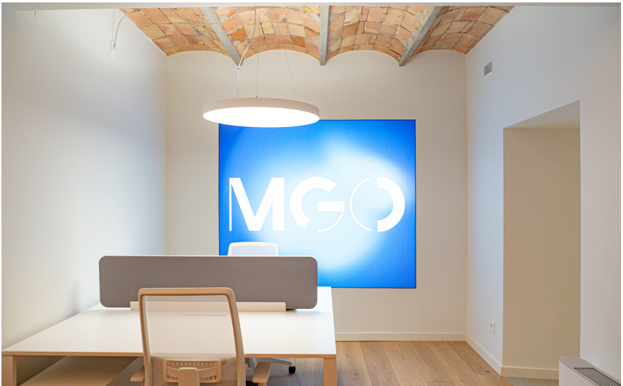
PROJECT: MGO IMMOBILIÀRIA / SANDRA SOLER STUDIO