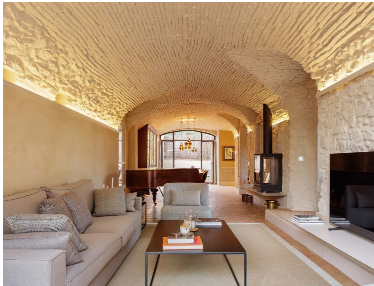
PROJECT: JOSEP CURANTA + PEPE GASCON