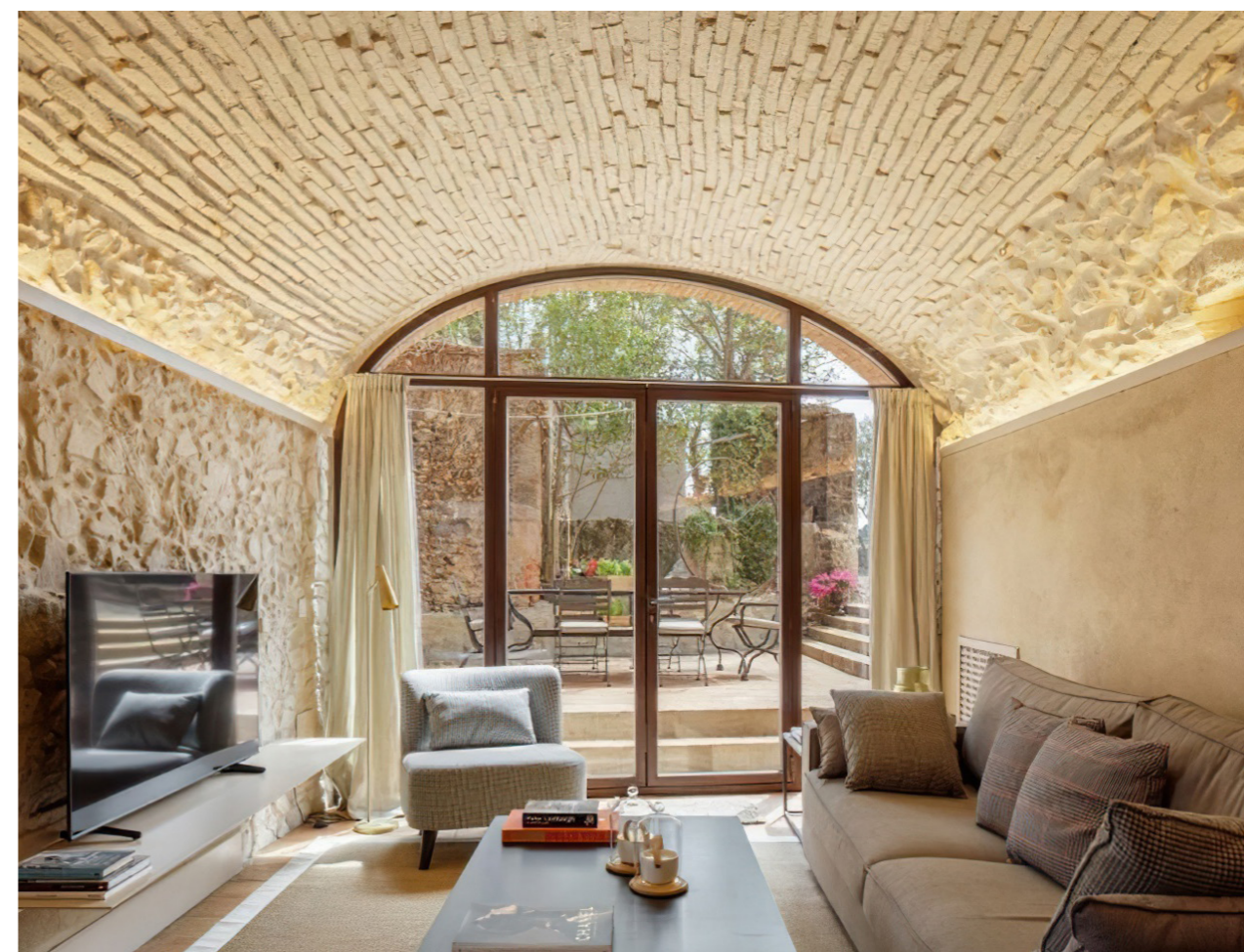
PROJECT: JOSEP CURANTA + PEPE GASCON