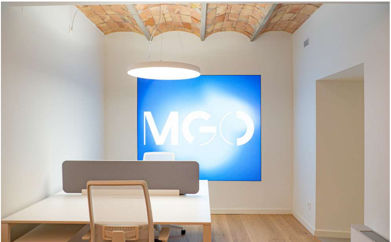
PROJECT: MGO IMMOBILIÀRIA / SANDRA SOLER STUDIO