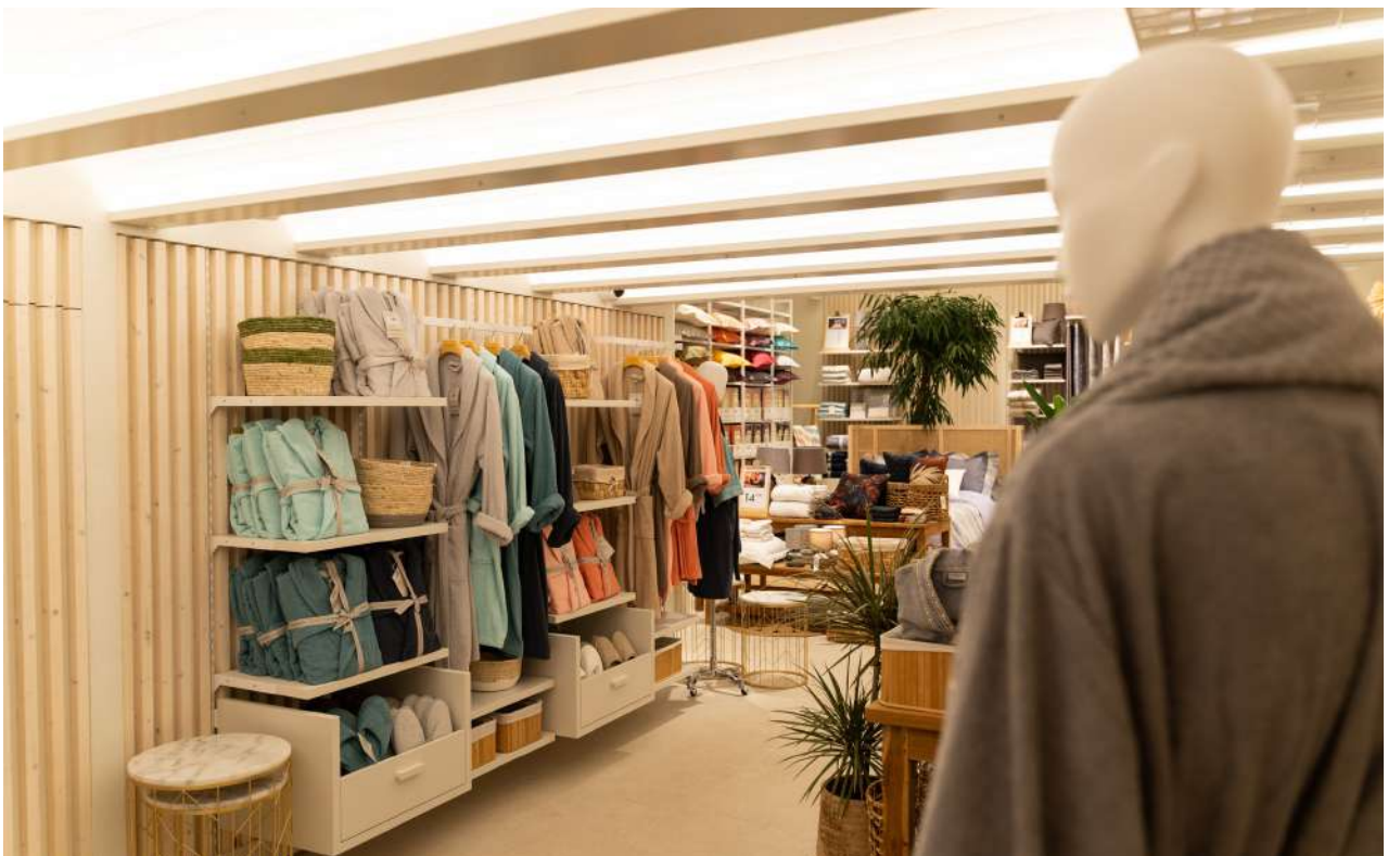
PROJECT: LA MALLORQUINA / ESTUDI FRANCESC PONS