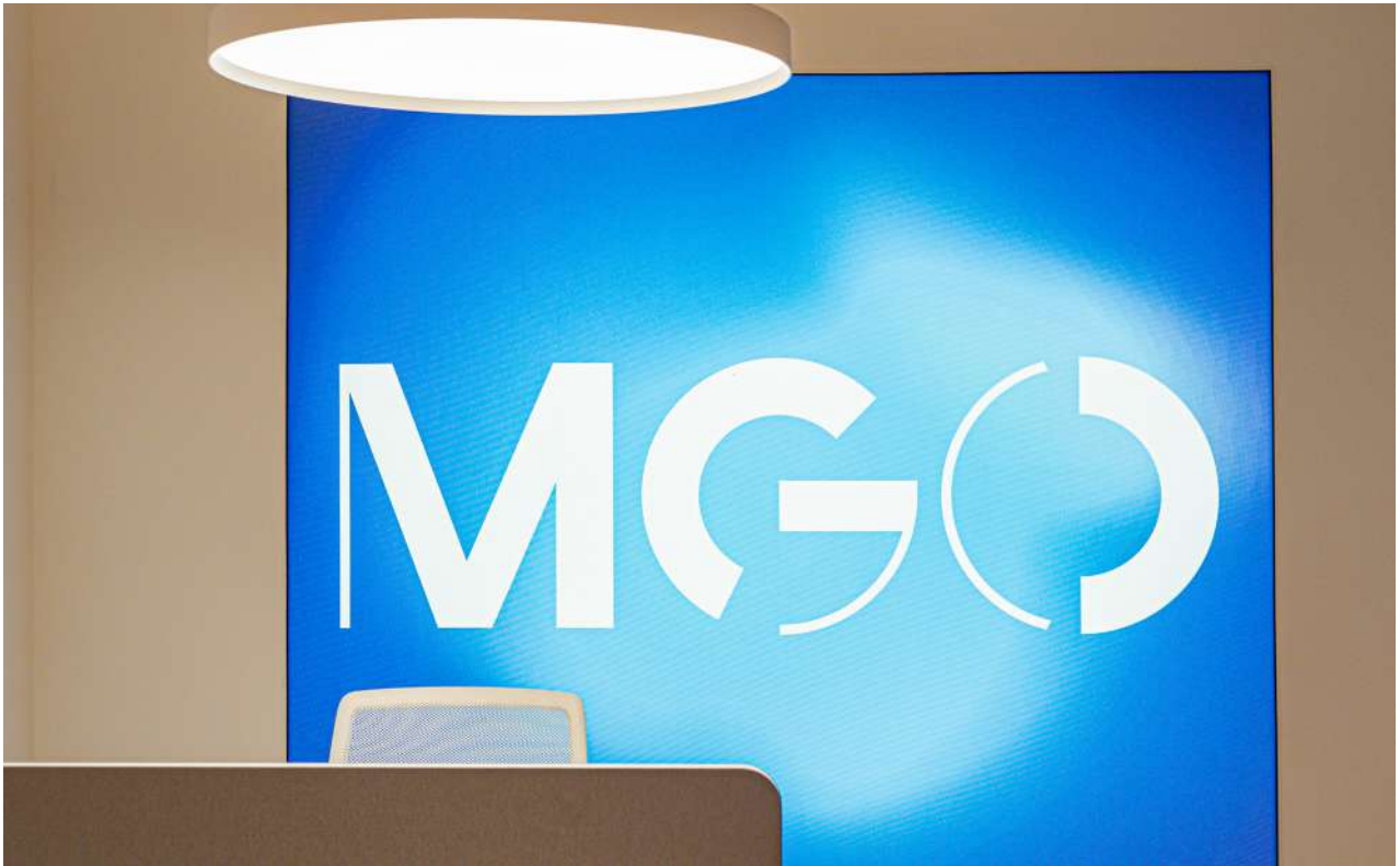
PROJECT: MGO IMMOBILIÀRIA / SANDRA SOLER STUDIO / PHOTO: JORDI CABANAS