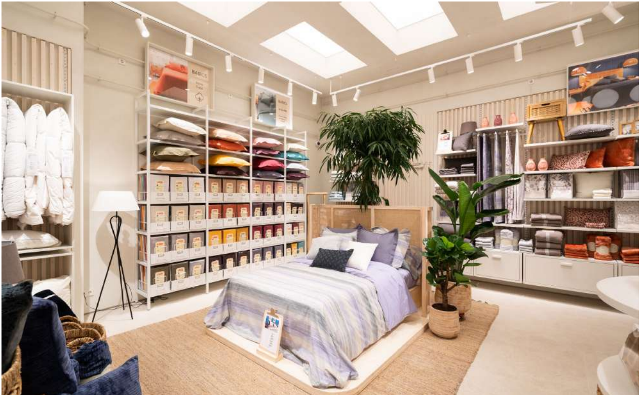
PROJECT: LA MALLORQUINA / ESTUDI FRANCESC PONS