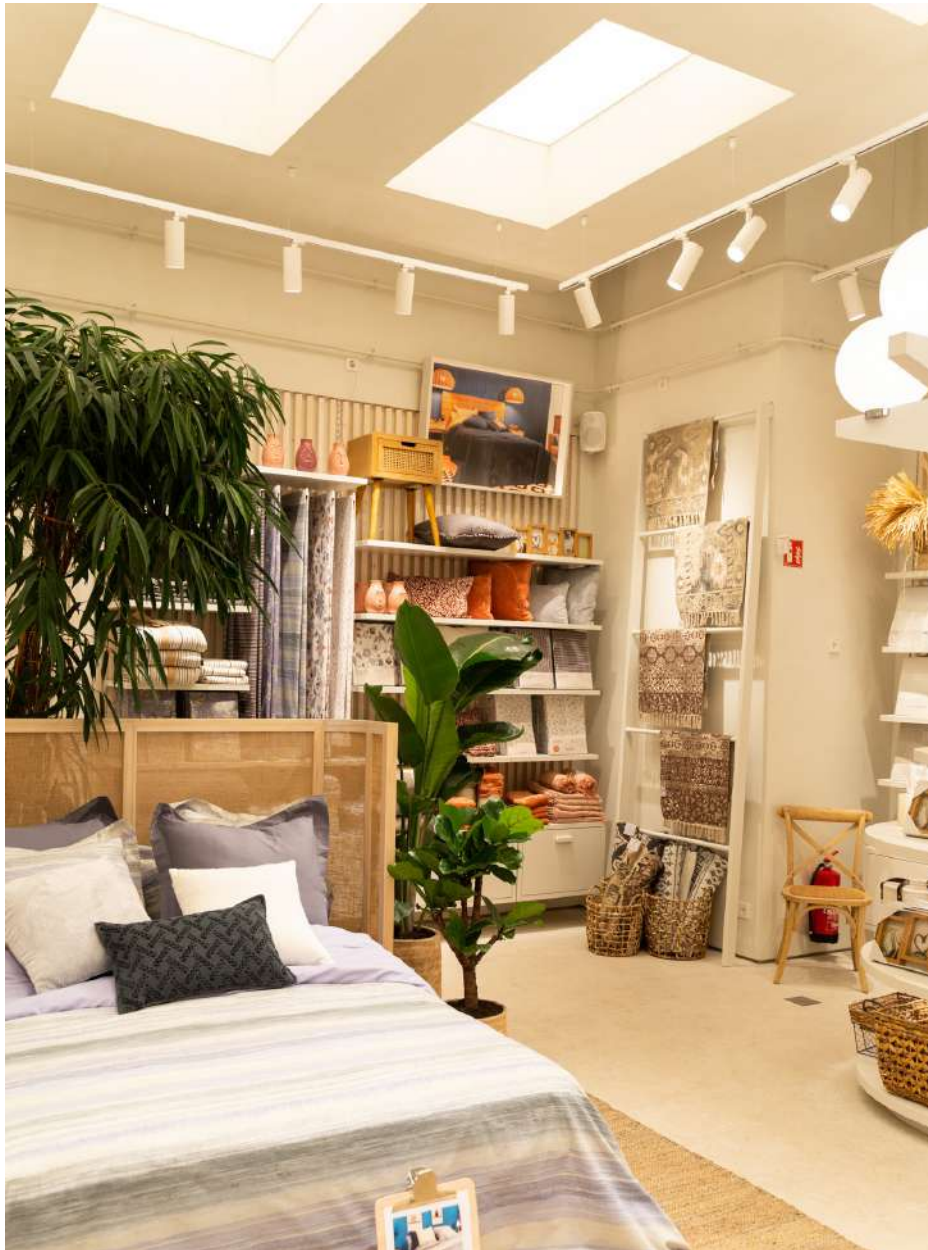
PROJECT: LA MALLORQUINA / ESTUDI FRANCESC PONS